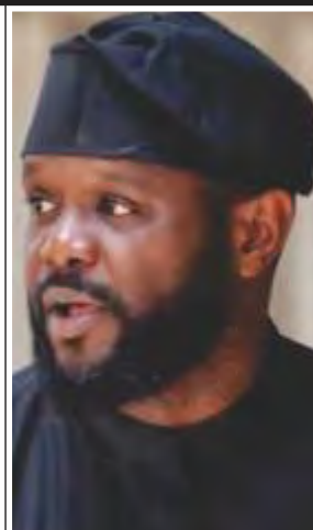
• Seyi Tinubu

Lagos Joins Africa To Power First-Ever Continental Blood Donation Day P.9